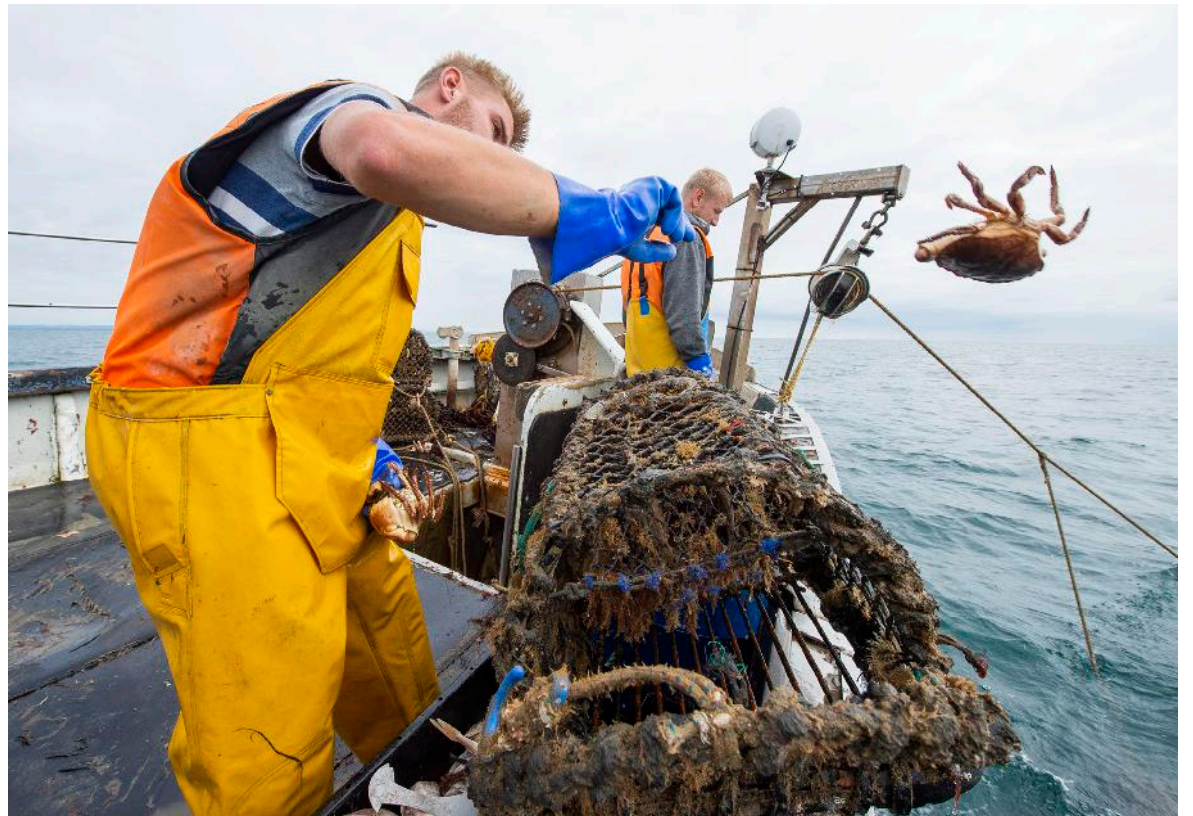
▲ Many crab and lobster fishermen are taking proactive steps to improve their local fisheries, such as returning soft-shelled crab to the water – but with a huge increase in effort, there is broad agreement that an overall management plan is needed for the future.

Some aspects of our crab and lobster management are good. We generally meet the first